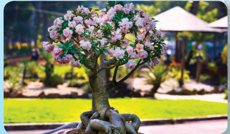
Mumbai Madness Adenium Desert Rose Adenium hybrids

We aren't happy if you aren't happy. If you have any questions regarding your order please call us at 1-800-428-9726 during the hours of 8:30 am and 4:30 pm EST. You can email questions to us at: plantquestions@robertasinc.com .