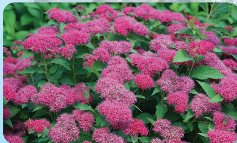
Spirea Double Play Doozie® Spiraea x

We aren't happy if you aren't happy. If you have any questions regarding your order please call us at 1-765-525-4065 during the hours of 8:30 am and 4:30 pm EST. You can email questions to us at: customerservice@robertasinc.com .