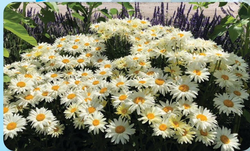
Shasta Daisy Leucanthemum x superbum

We aren't happy if you aren't happy. If you have any questions regarding your order please call us at 1-765-525-4065 during the hours of 8:30 am and 4:30 pm EST.