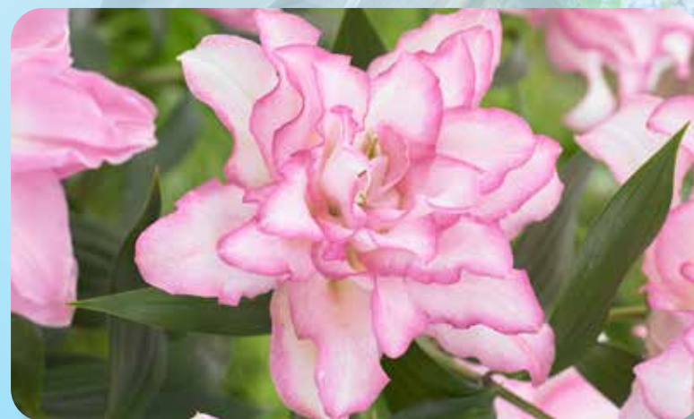
5pc Fragrant Roselily Collection Lilium hybrids

We aren't happy if you aren't happy. If you have any questions regarding your order please call us at 1-765-525-4065 during the hours of 8:30 am and 4:30 pm EST.