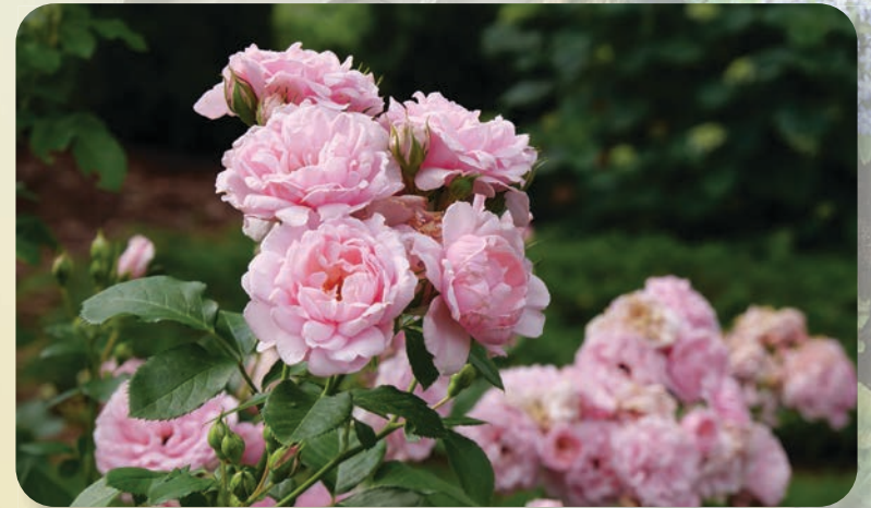
Parfuma® Summer Romance Shrub Rose Rosa hybrid 'Parfuma'