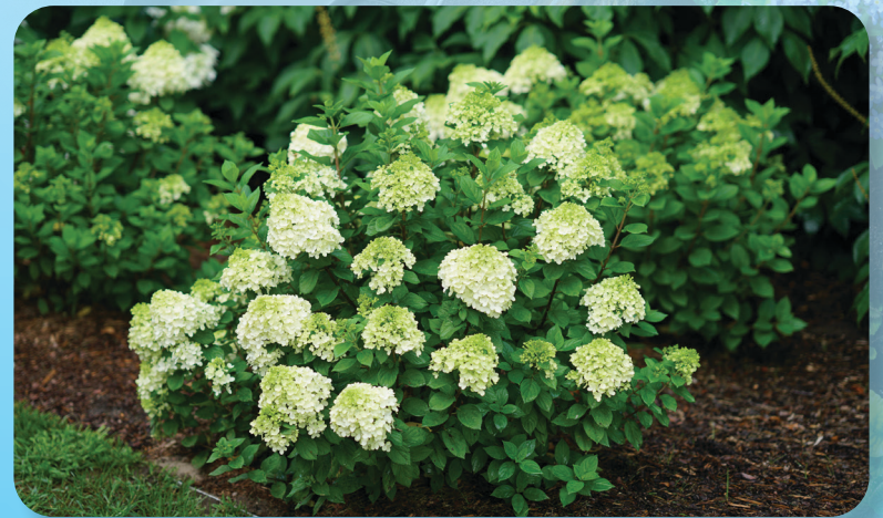
Proven Winners® Little Lime Punch™ Hydrangea Hydrangea paniculata