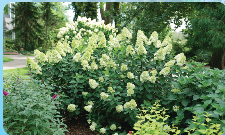
Proven Winners® Limelight Prime® Hydrangea Hydrangea paniculata

"Magic isn't so much what you create, it's what you notice."