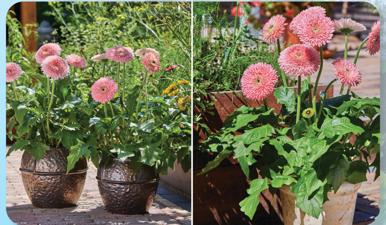
Glorious Patio Gerber Daisies Gerbera hybrids

We aren't happy if you aren't happy. If you have any questions regarding your order please call us at 1-765-525-4065 during the hours of 8:30 am and 4:30 pm EST.