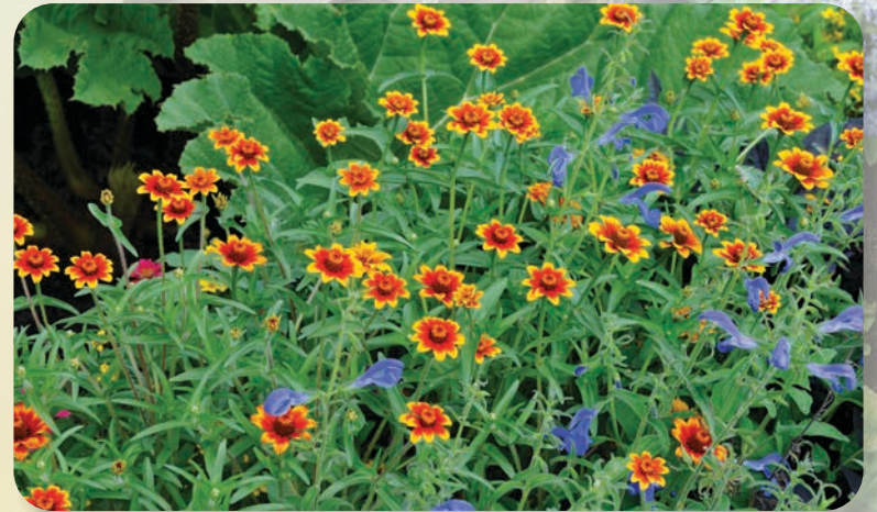
'Chippendale' Daisy Zinnia Mix 5pc Zinnia haageana