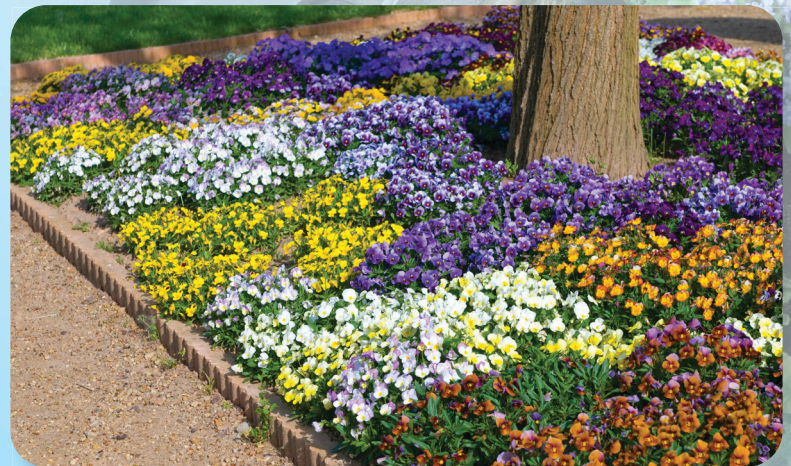
Hardy Sorbet® Series Viola Viola cornuta hybrids