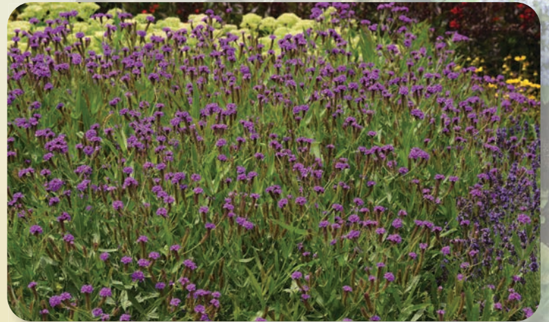
Verbena 'Vanity' Verbena bonariensis hybrid