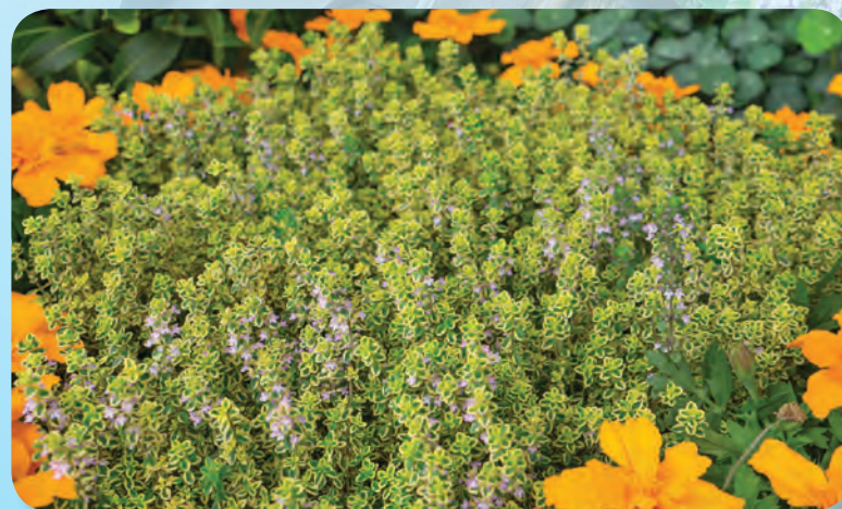
Variegated Lemon Thyme Thymus spp.

Thank You for bringing us into your home