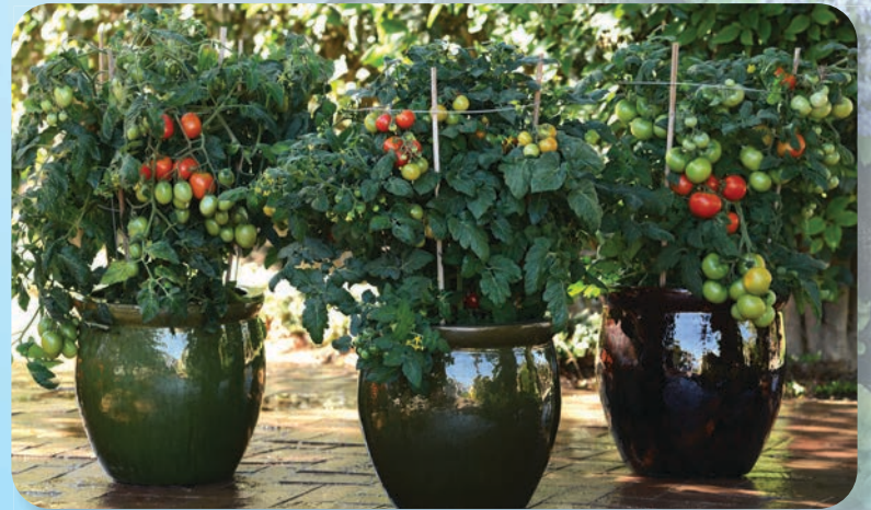
Tomato Lover's Collection Solanum lycopersicum 'Tomato Lovers'