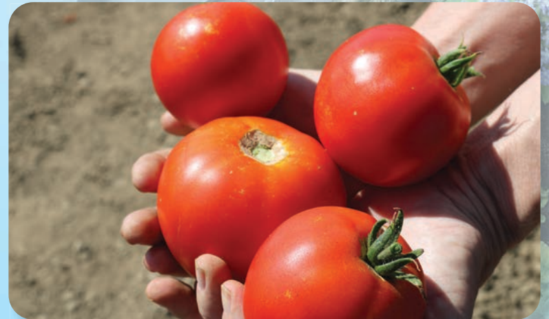
Tomato Lovers Collection Solanum lycopersicum

We aren't happy if you aren't happy. If you have any questions regarding your order please call us at 1-765-525-4065 during the hours of 8:30 am and 4:30 pm EST.