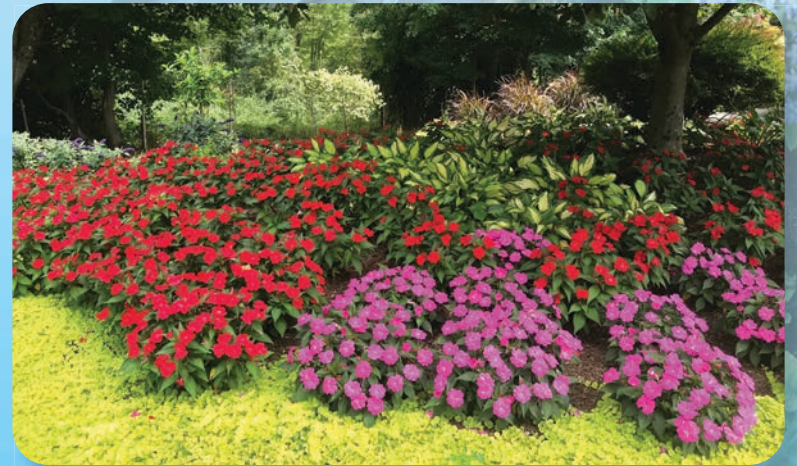
SunPatiens® with Whiskey Barrel Impatiens spp.