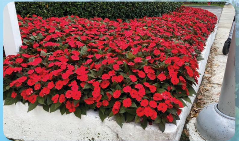
Vigorous SunPatiens® Collection Impatiens spp.