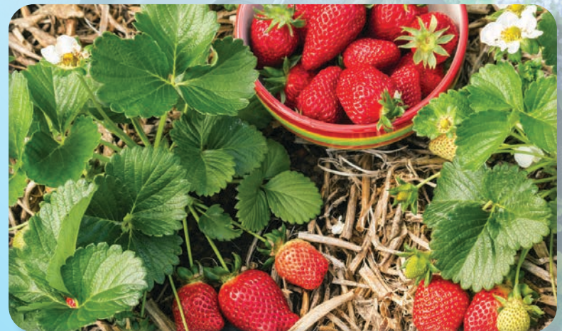
Strawberry Ozark Everbearing Fragaria ananassa hybrids

We aren't happy if you aren't happy. If you have any questions regarding your order please call us at 1-765-525-4065 during the hours of 8:30 am and 4:30 pm EST.