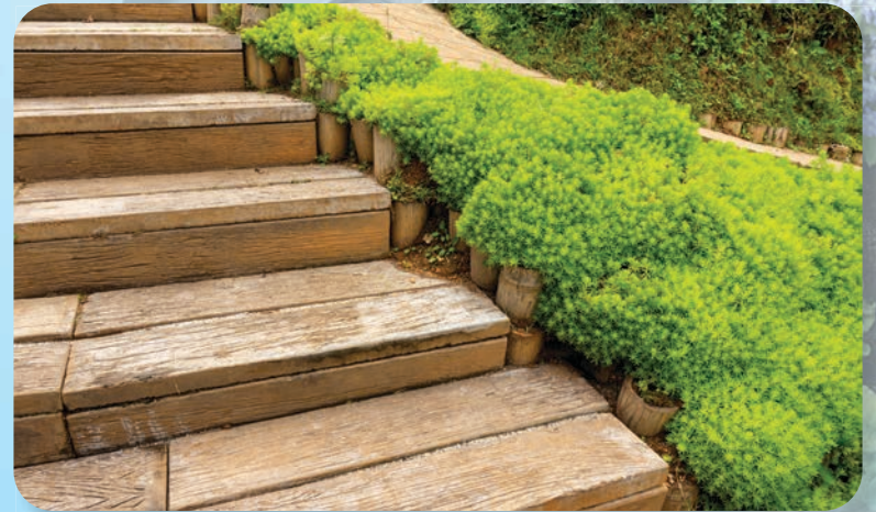
Golden Angelina Stonecrop Sedum rupestre 'Angelina'

We aren't happy if you aren't happy. If you have any questions regarding your order please call us at 1-765-525-4065 during the hours of 8:30 am and 4:30 pm EST. You can email questions to us at: customerservice@robertasinc.com .