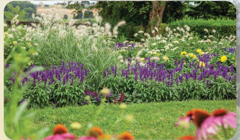
Salvia Evolution® Violet Salvia farinacea