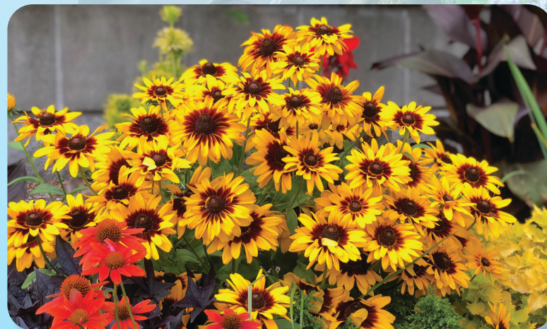
Minibeckia™ 'Flame' Rudbeckia x hybrida

We aren't happy if you aren't happy. If you have any questions regarding your order please call us at 1-765-525-4065 during the hours of 8:30 am and 4:30 pm EST. You can email questions to us at: customerservice@robertasinc.com .