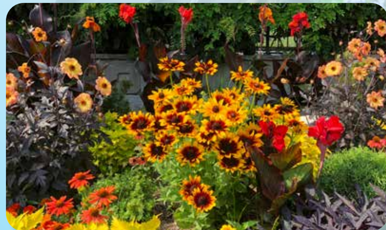
1pc Minibeckia™ 'Flame' Rudbeckia x hybrida

We aren't happy if you aren't happy. If you have any questions regarding your order please call us at 1-765-525-4065 during the hours of 8:30 am and 4:30 pm EST.