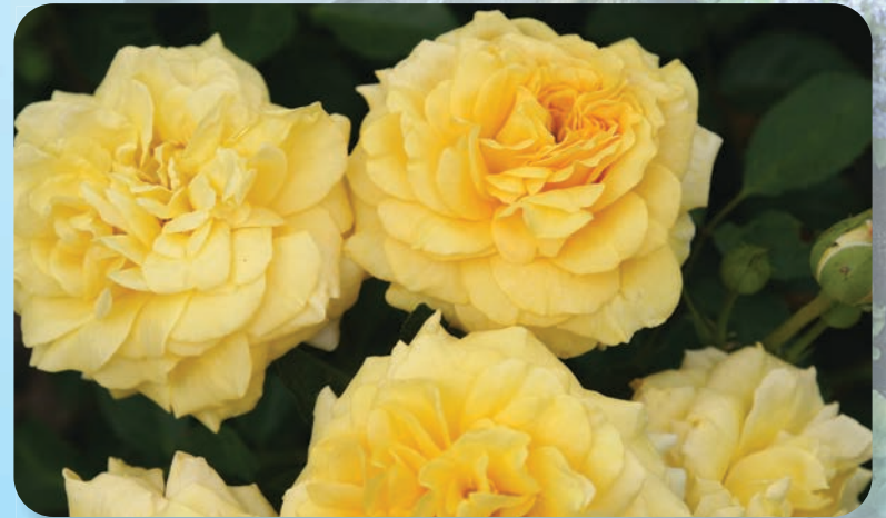
Sunbelt® Roses Rosa hybrid 'Sunbelt'

We aren't happy if you aren't happy. If you have any questions regarding your order please call us at 1-765-525-4065 during the hours of 8:30 am and 4:30 pm EST.