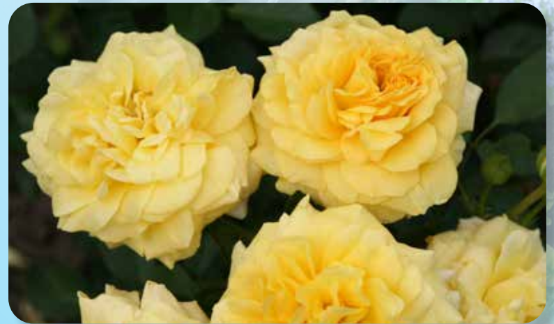
1pc Sunbelt® Roses (choice of) Rosa hybrid 'Sunbelt'

We aren't happy if you aren't happy. If you have any questions regarding your order please call us at 1-765-525-4065 during the hours of 8:30 am and 4:30 pm EST.