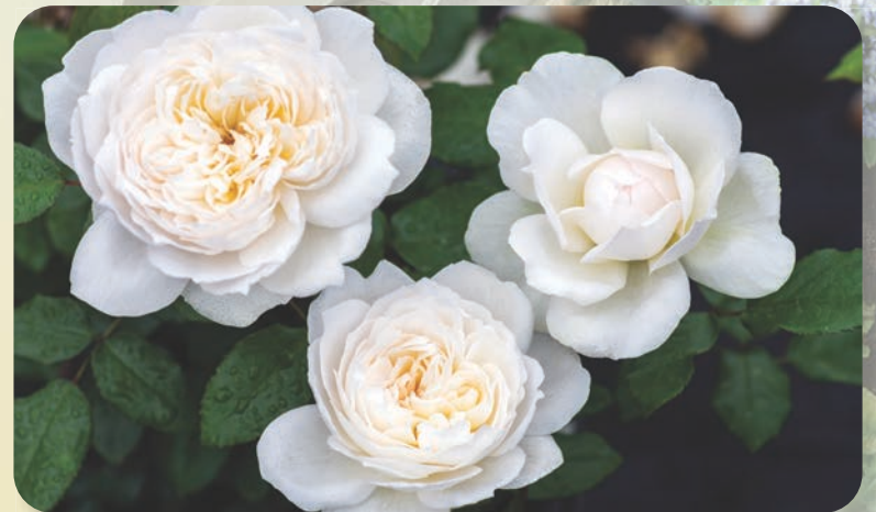
Scentables™ Rose (choice of) Rosa hybrids