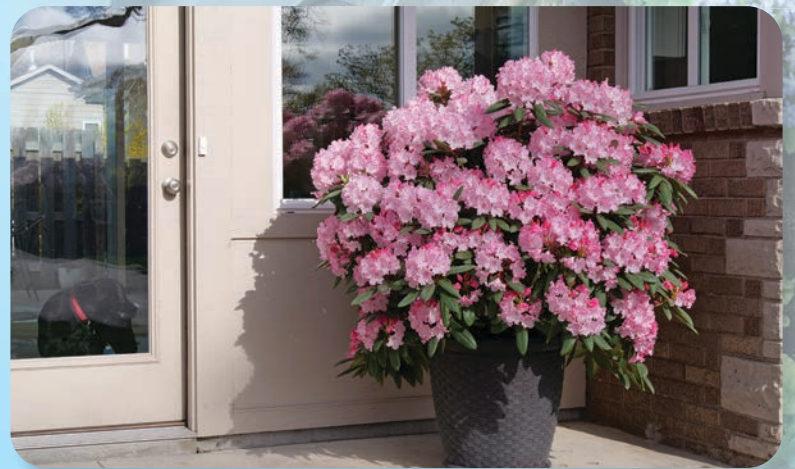
Proven Winners® Dandy Man Color Wheel® Rhododendron x

We aren't happy if you aren't happy. If you have any questions regarding your order please call us at 1-765-525-4065 during the hours of 8:30 am and 4:30 pm EST. You can email questions to us at: customerservice@robertasinc.com .