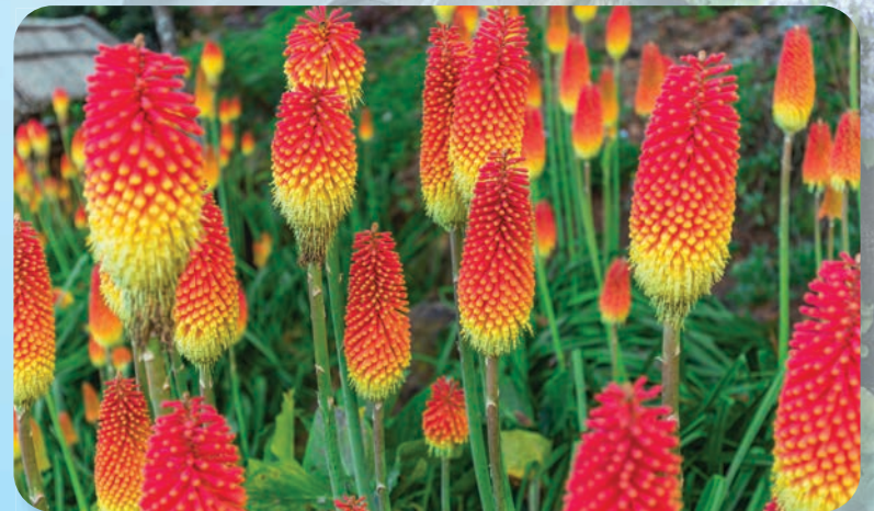
Red Hot Poker Flowers Kniphofia uvaria

We aren't happy if you aren't happy. If you have any questions regarding your order please call us at 1-765-525-4065 during the hours of 8:30 am and 4:30 pm EST.