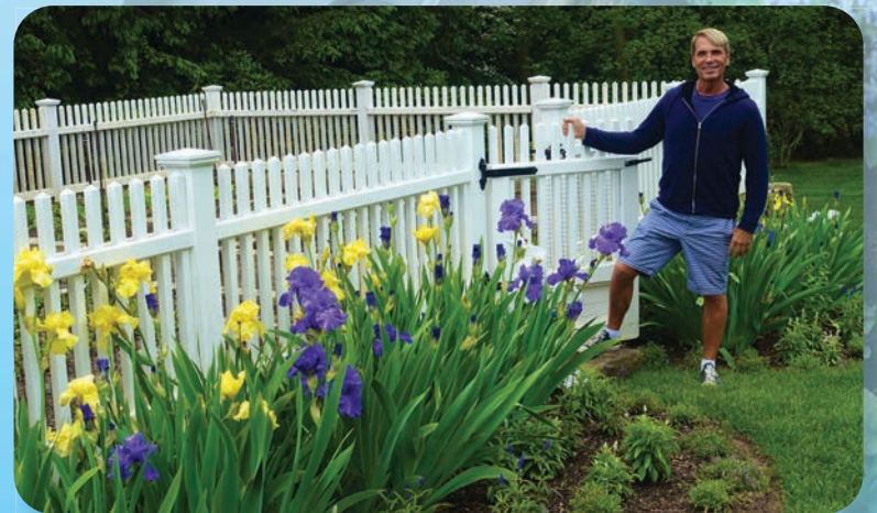
ReBlooming Bearded Iris Iris germanica

"Magic isn't so much what you create, it's what you notice."