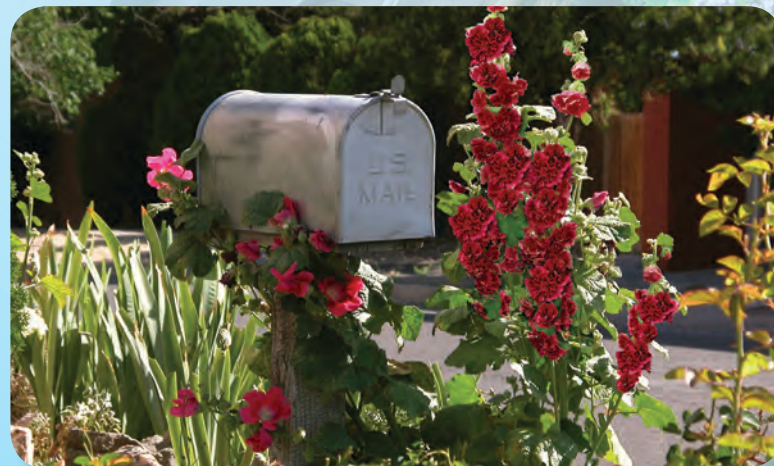
Queen Series Hollyhocks Alcea rosea

We aren't happy if you aren't happy. If you have any questions regarding your order please call us at 1-800-428-9726 during the hours of 8:30 am and 4:30 pm EST. You can email questions to us at: plantquestions@robertasinc.com .