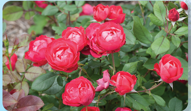
Proven Winners® OSO Easy® Rose Rosa hybrida

We aren't happy if you aren't happy. If you have any questions regarding your order please call us at 1-765-525-4065 during the hours of 8:30 am and 4:30 pm EST. You can email questions to us at: customerservice@robertasinc.com .