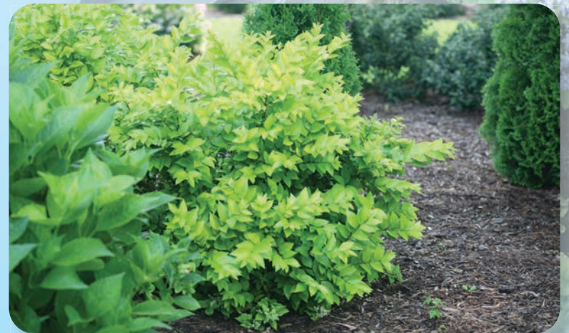
Proven Winners® Golden Ticket® Privet Ligustrum x vicryi

We aren't happy if you aren't happy. If you have any questions regarding your order please call us at 1-765-525-4065 during the hours of 8:30 am and 4:30 pm EST. You can email questions to us at: customerservice@robertasinc.com .