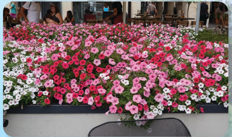
Itsy™ Petunias Petunia hybrida

We aren't happy if you aren't happy. If you have any questions regarding your order please call us at 1-765-525-4065 during the hours of 8:30 am and 4:30 pm EST.