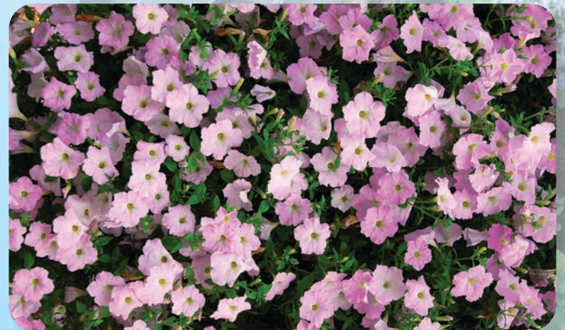
DuraBloom™ Series Petunias Petunia hybrida

We aren't happy if you aren't happy. If you have any questions regarding your order please call us at 1-765-525-4065 during the hours of 8:30 am and 4:30 pm EST.