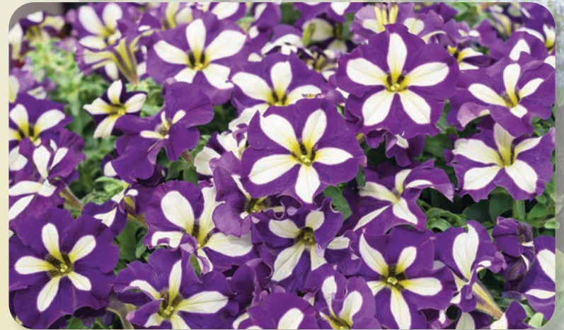
Crazytunias® Frisky Petunias 6pc Petunia hybrida