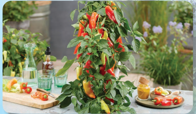
Sweet Caroline Ponky™ Snacking Peppers 3pc Capsicum annum

We aren't happy if you aren't happy. If you have any questions regarding your order please call us at 1-765-525-4065 during the hours of 8:30 am and 4:30 pm EST.