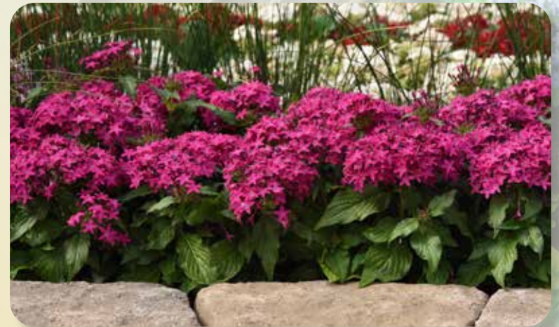
3pc 'Kaleidoscope' Penta Collection Penta hybrids