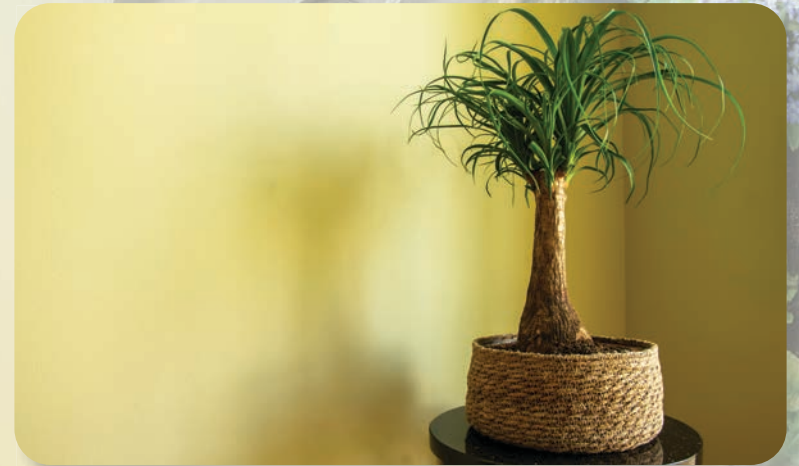
Ponytail Palm Beaucarnea recurvata