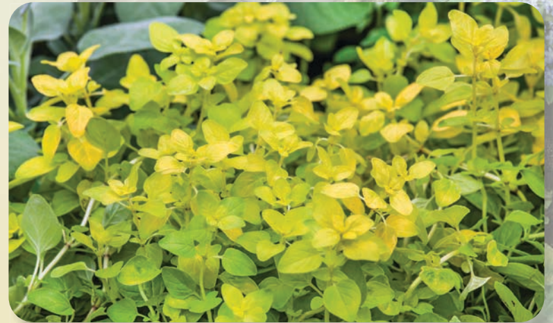
Flowering Golden Oregano Origanum vulgare 'Aureum'