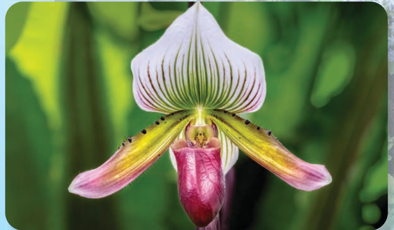
Lady Slipper Orchid Paphiopedilum hybrids 'Maudiae'

We aren't happy if you aren't happy. If you have any questions regarding your order please call us at 1-765-525-4065 during the hours of 8:30 am and 4:30 pm EST.