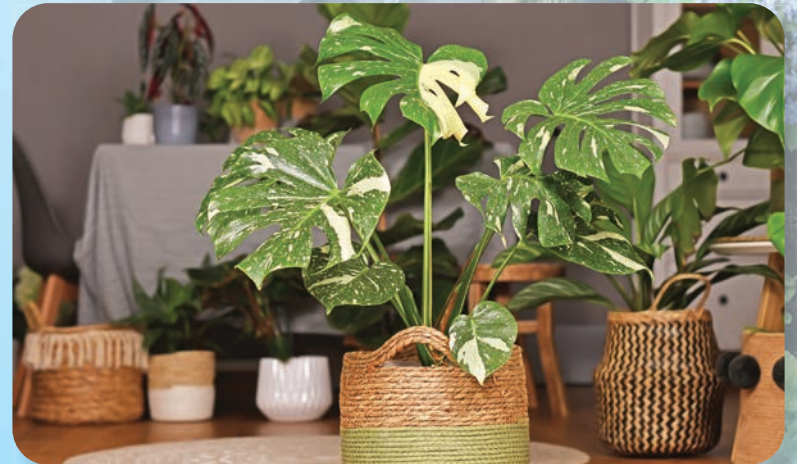
Variegated Monstera Thai Constellation Monstera deliciosa variegata 'Thai Constellation'

We aren't happy if you aren't happy. If you have any questions regarding your order please call us at 1-765-525-4065 during the hours of 8:30 am and 4:30 pm EST.