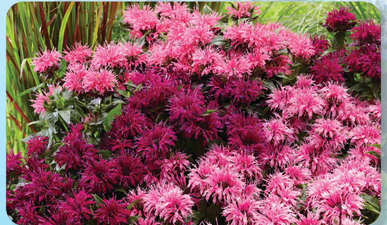
Monarda Balmy™ Series 3pc Monarda didyma hybrid

We aren't happy if you aren't happy. If you have any questions regarding your order please call us at 1-765-525-4065 during the hours of 8:30 am and 4:30 pm EST. You can email questions to us at: customerservice@robertasinc.com .