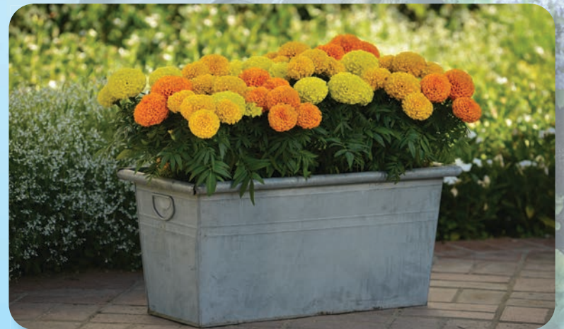
Taishan® Marigolds Tagetes erecta

We aren't happy if you aren't happy. If you have any questions regarding your order please call us at 1-765-525-4065 during the hours of 8:30 am and 4:30 pm EST.