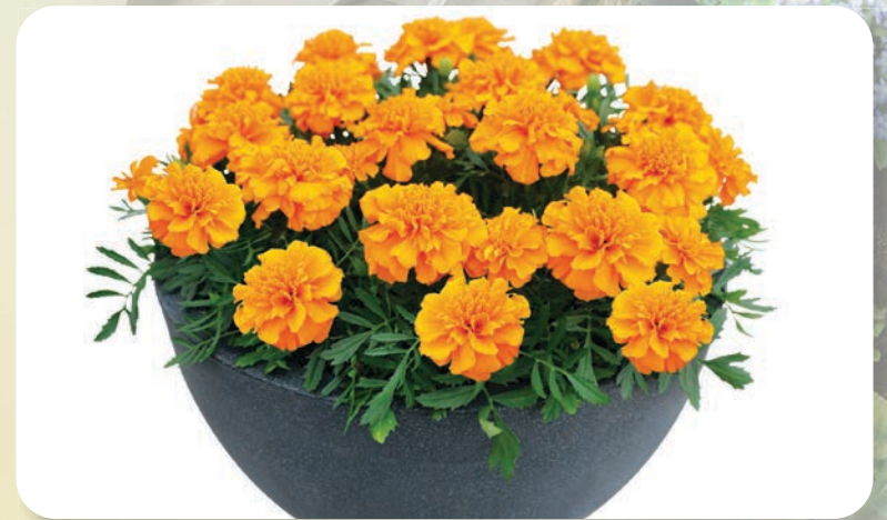
Super Hero™ Marigold Collection Tagetes patula