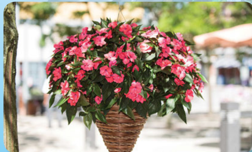
SunPatiens® Lovebirds Collection Impatiens spp.