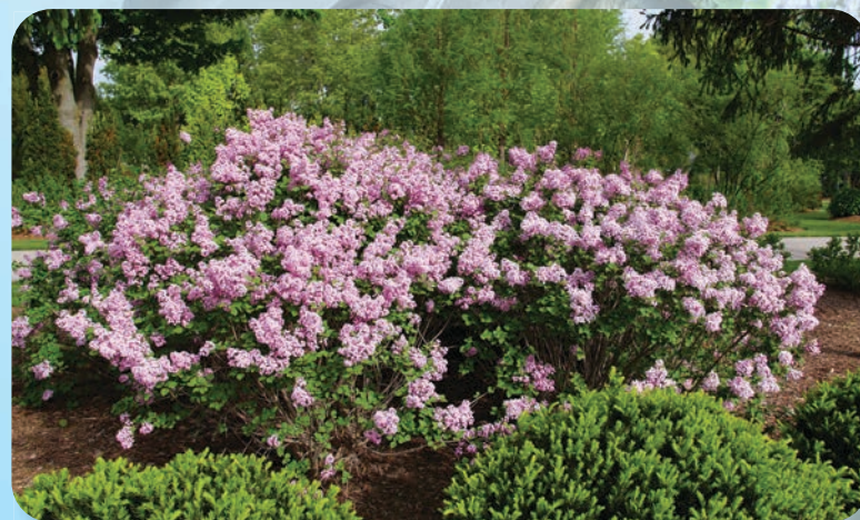
Proven Winners® Bloomerang® Dwarf Purpink® Lilac Syringa x hybrida

We aren't happy if you aren't happy. If you have any questions regarding your order please call us at 1-765-525-4065 during the hours of 8:30 am and 4:30 pm EST. You can email questions to us at: customerservice@robertasinc.com .