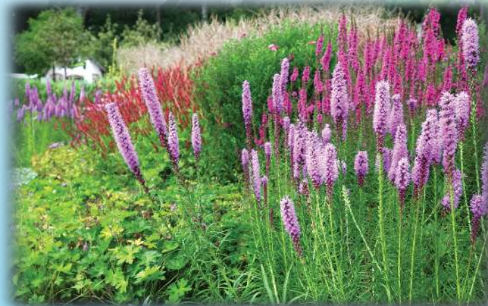
Liatris Blazing Star Liatris spicata