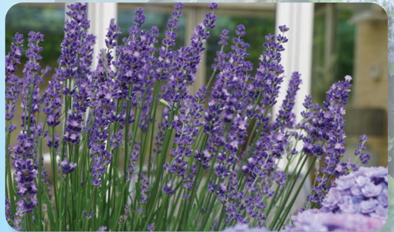
SuperBlue Lavender Lavandula hybrid

We aren't happy if you aren't happy. If you have any questions regarding your order please call us at 1-765-525-4065 during the hours of 8:30 am and 4:30 pm EST. You can email questions to us at: customerservice@robertasinc.com .