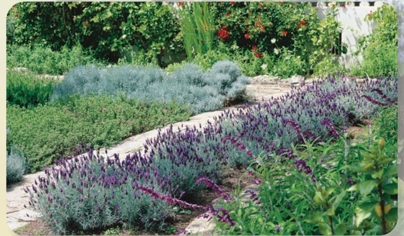
Spanish Silver Anouk Lavender Lavandula stoechas