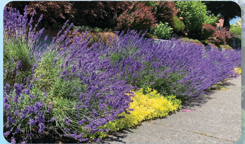
American Bred Sensational® Lavender Lavandula x intermedia 'Sensational'