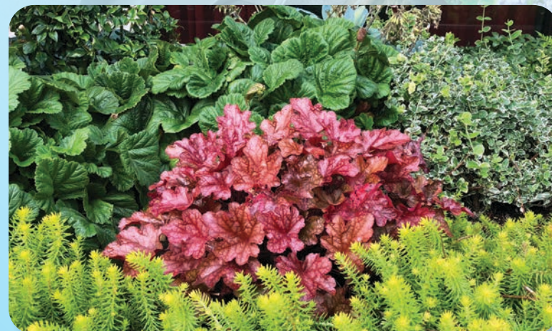
Indian Summer Coral Bells Heuchera hybrida

We aren't happy if you aren't happy. If you have any questions regarding your order please call us at 1-765-525-4065 during the hours of 8:30 am and 4:30 pm EST.