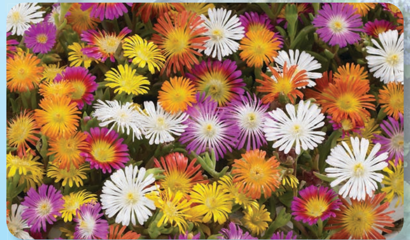
WOW® Series Ice Plant Delosperma cooperi hybrids

We aren't happy if you aren't happy. If you have any questions regarding your order please call us at 1-765-525-4065 during the hours of 8:30 am and 4:30 pm EST. You can email questions to us at: customerservice@robertasinc.com .