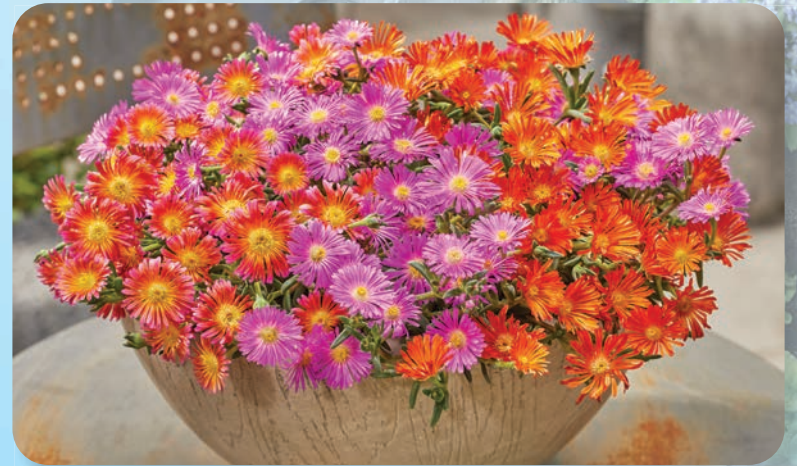
Ocean Sunset™ Series Ice Plants 6pc Delosperma cooperi hybrids

We aren't happy if you aren't happy. If you have any questions regarding your order please call us at 1-765-525-4065 during the hours of 8:30 am and 4:30 pm EST. You can email questions to us at: customerservice@robertasinc.com .