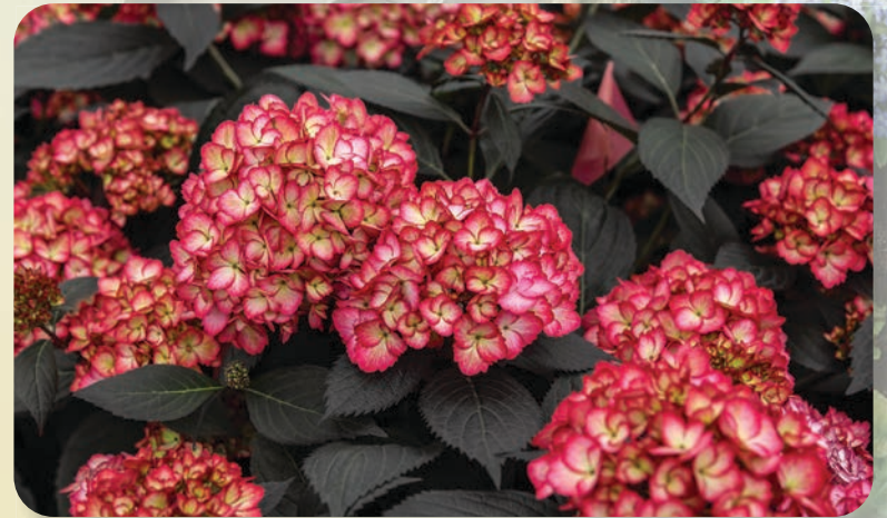
First Editions® Eclipse® Hydrangea Hydrangea macrophylla hybrid